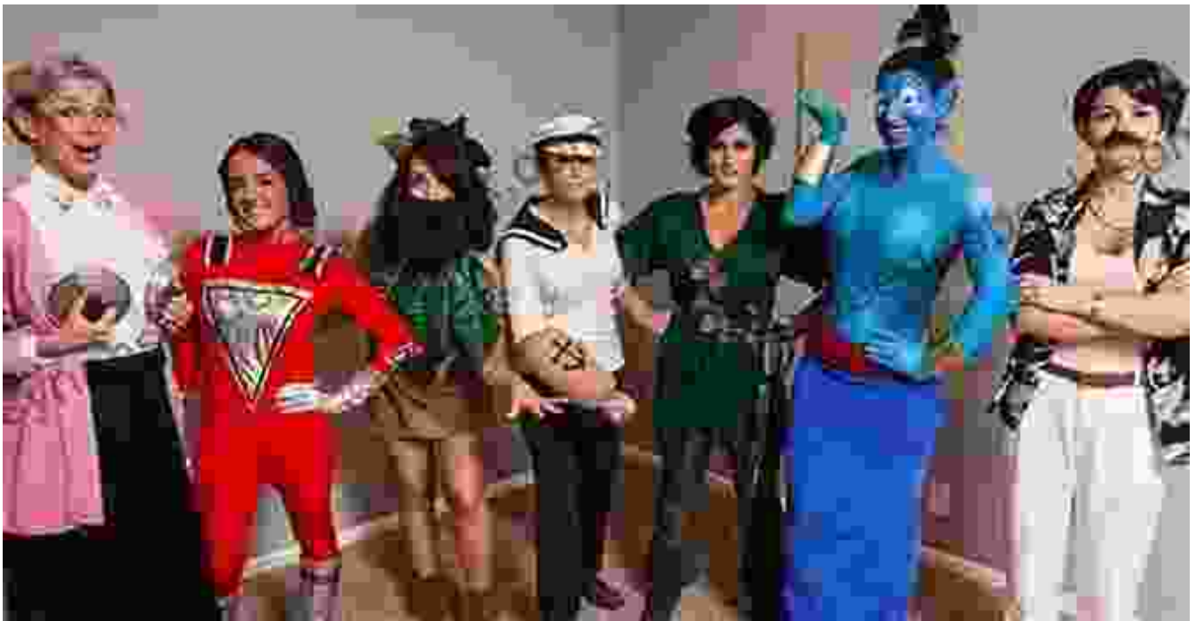
Actors in costume for a production of Shakespeare's Hamlet .