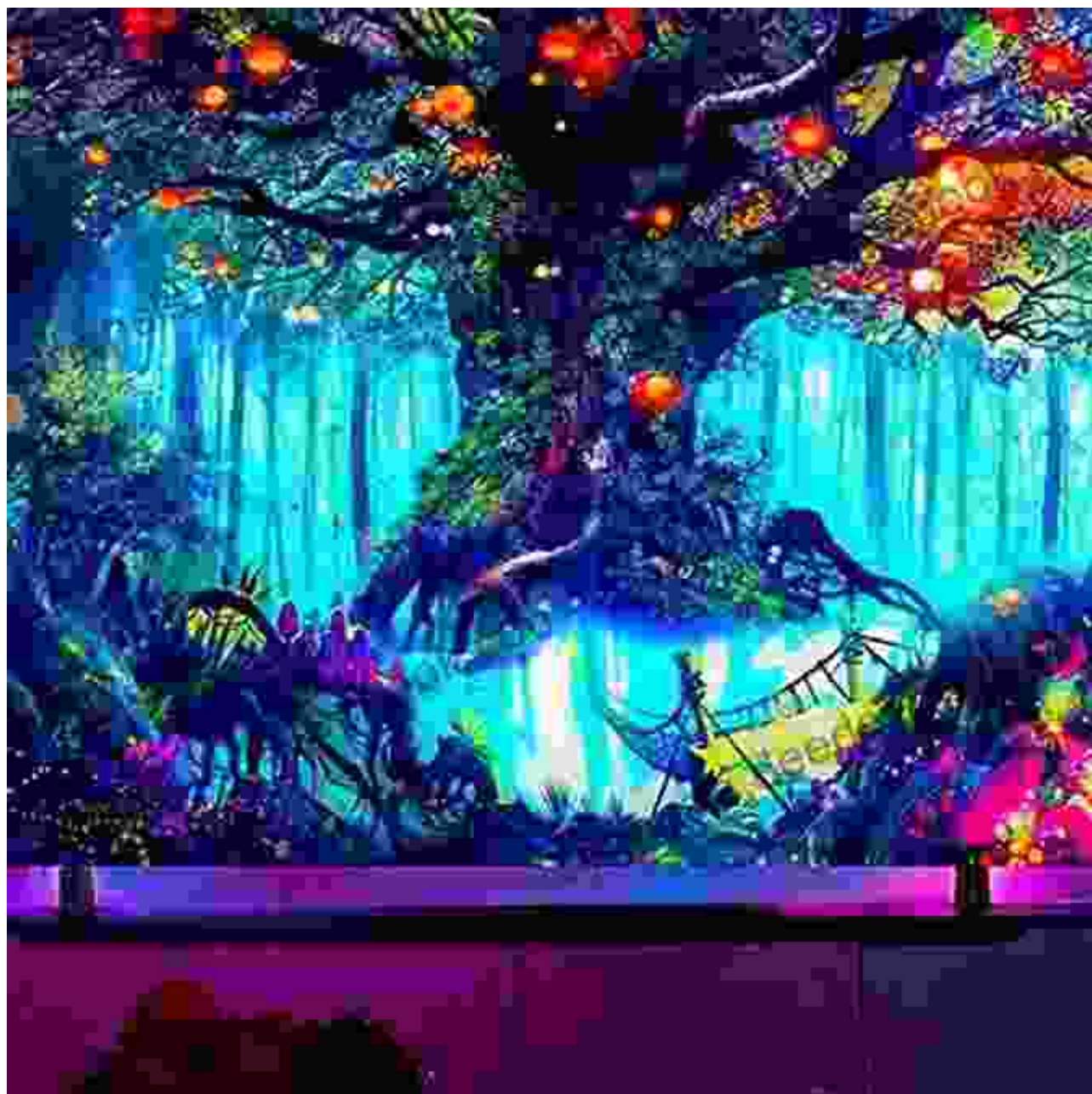
A vibrant tapestry of life in the Amazon rainforest