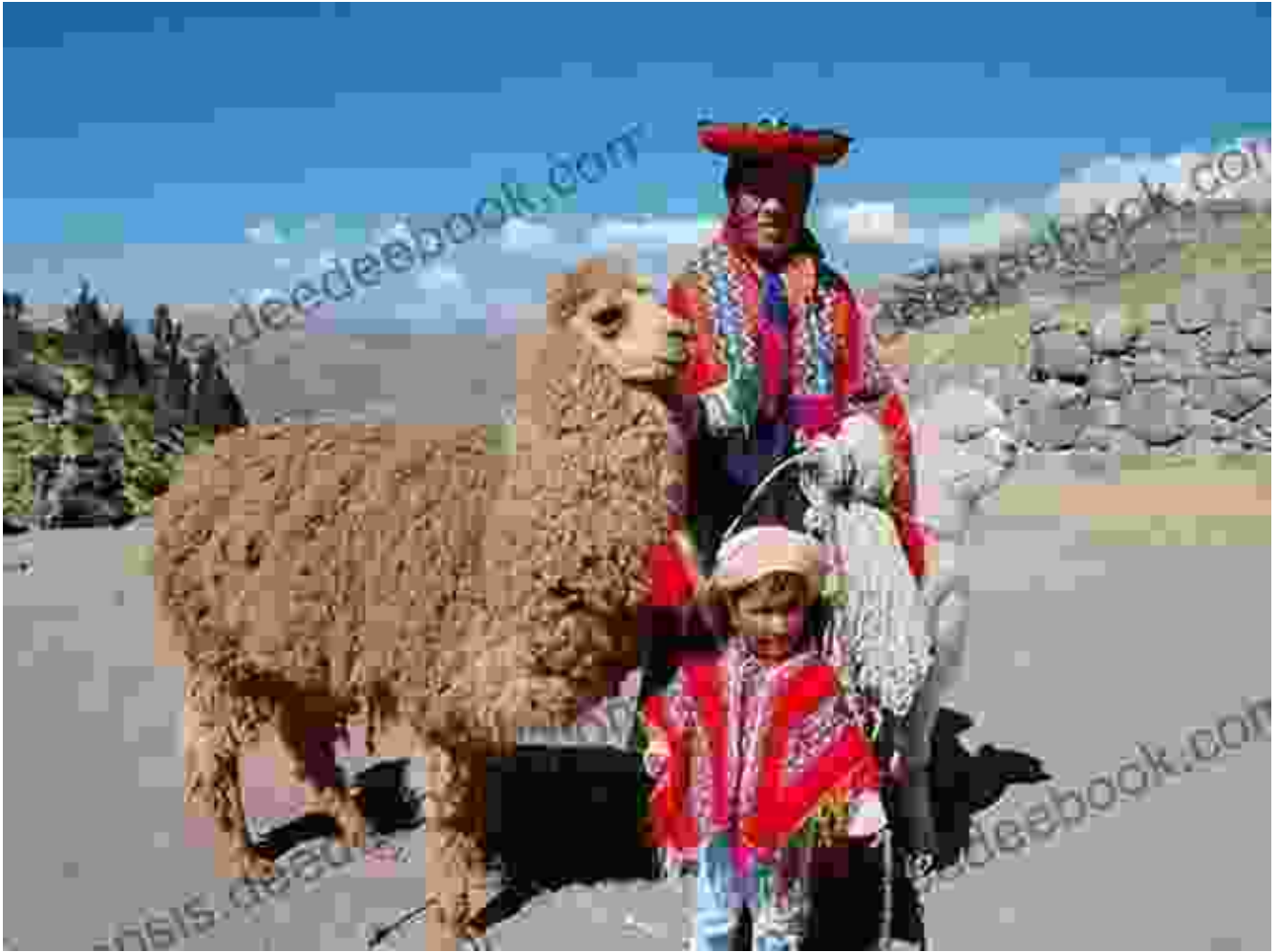
The warm and welcoming people of rural Peru