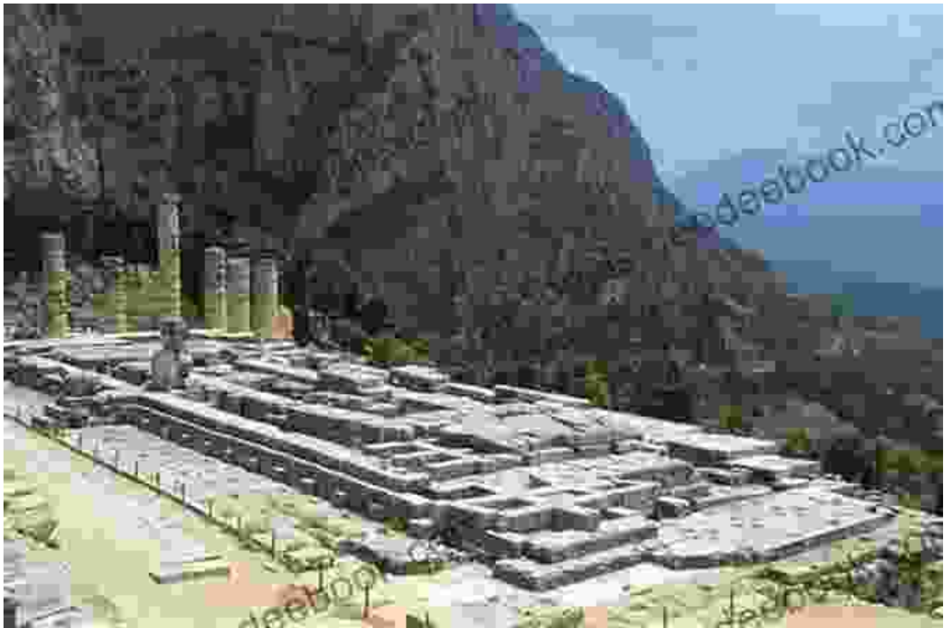
The Temple of Apollo at Delphi, Greece.